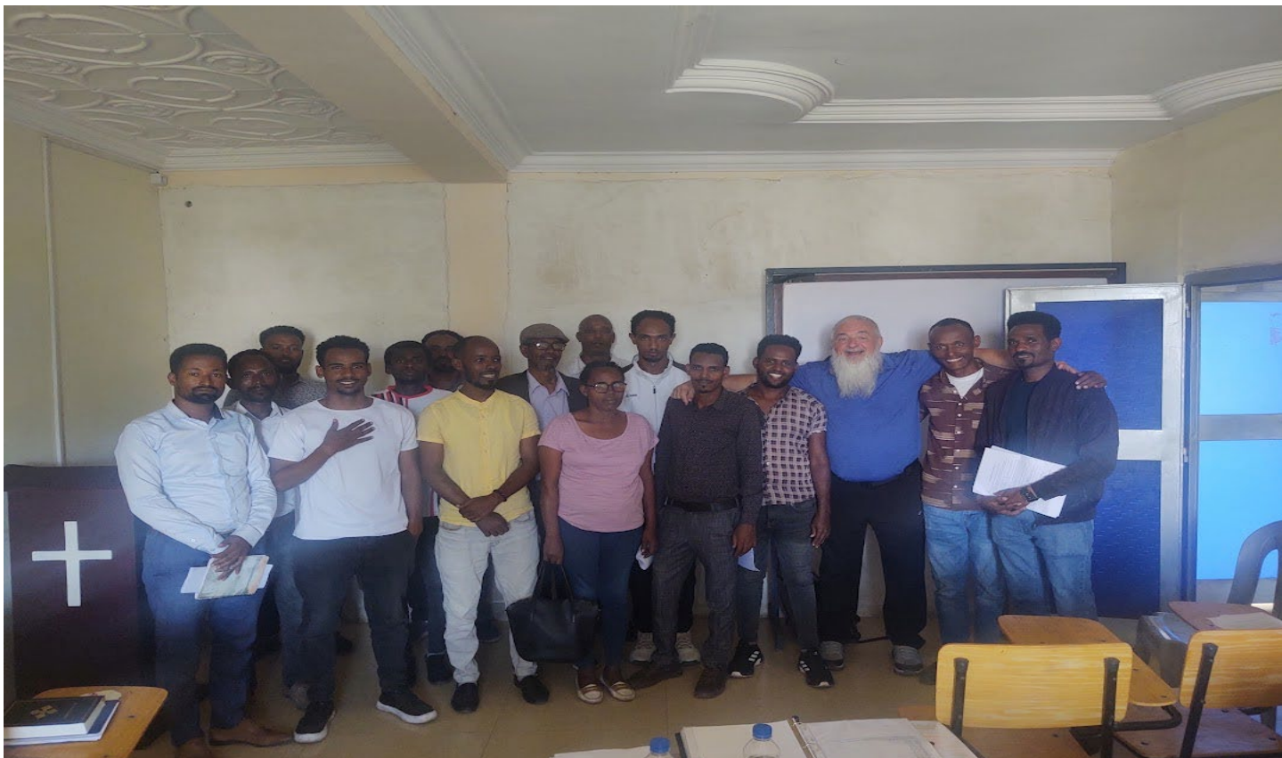
Adama first group (4/22—23/2024).

We conducted two, two-day round two life-changing trainings entitled “The Kingdom Life According to Jesus,” an exegetical study of Jesus’ “Great Sermon on the Mount (Matt. 5—7) this week. The first group (pictured above) on Monday and Tuesday (4/22—23). The final training (group pictured below) conducted on Thursday and Friday 4/25—26/2024) has just wound down.